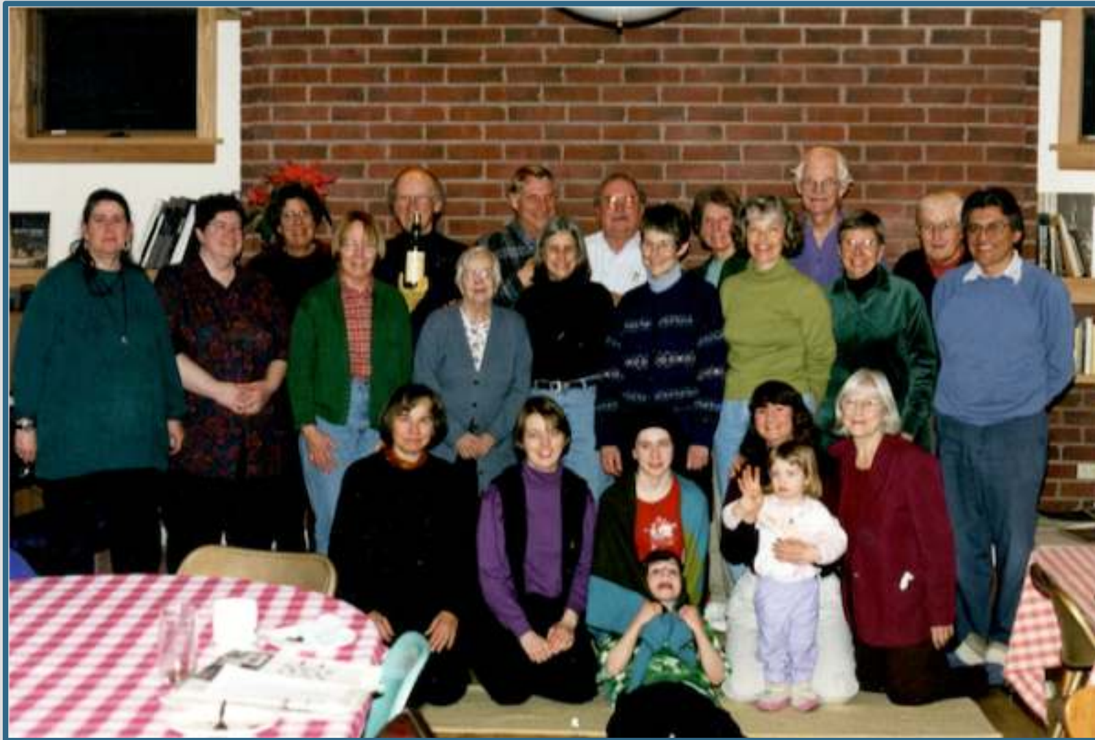
VCC Year-End Celebration, ca. 2003