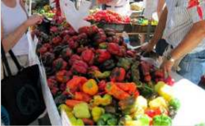
Largest Farmer's Market East of the Mississippi