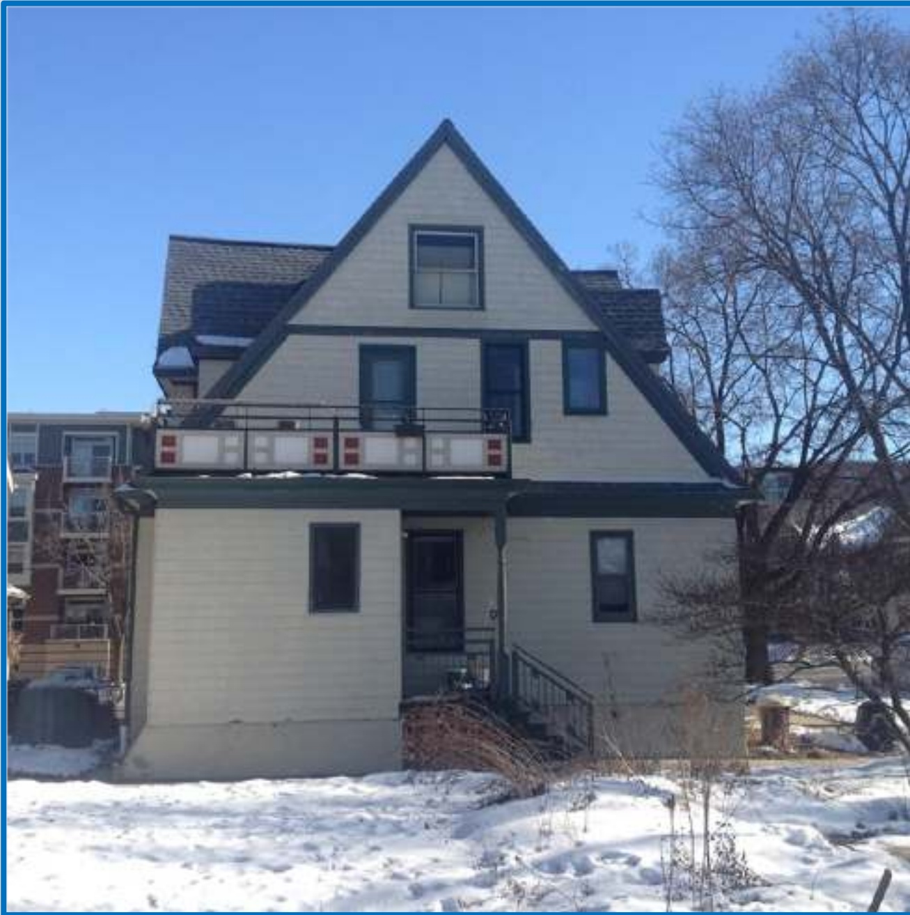
Green and off-White House, 19th. Century