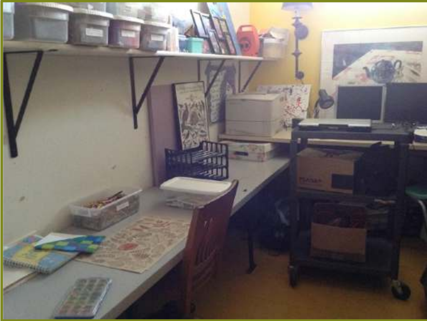
Art - “All purpose” room