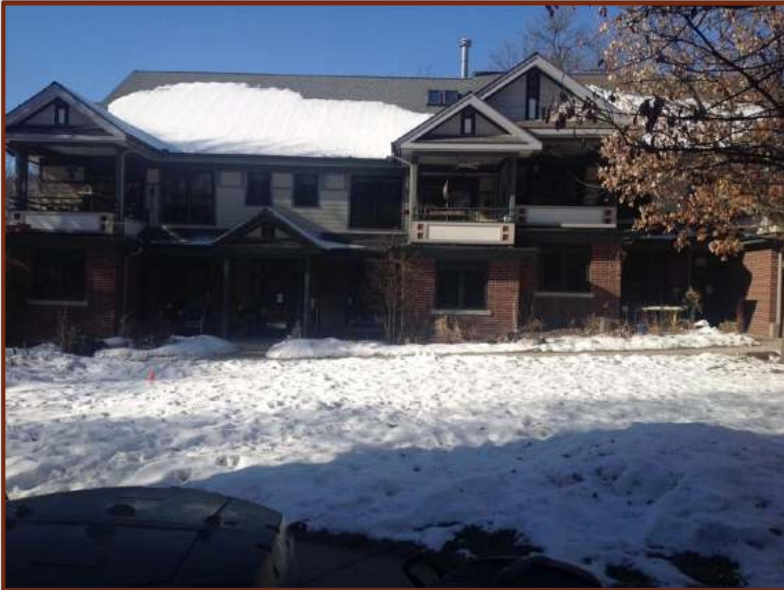
Nine unit building