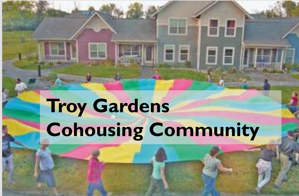
Troy Gardens Cohousing Community