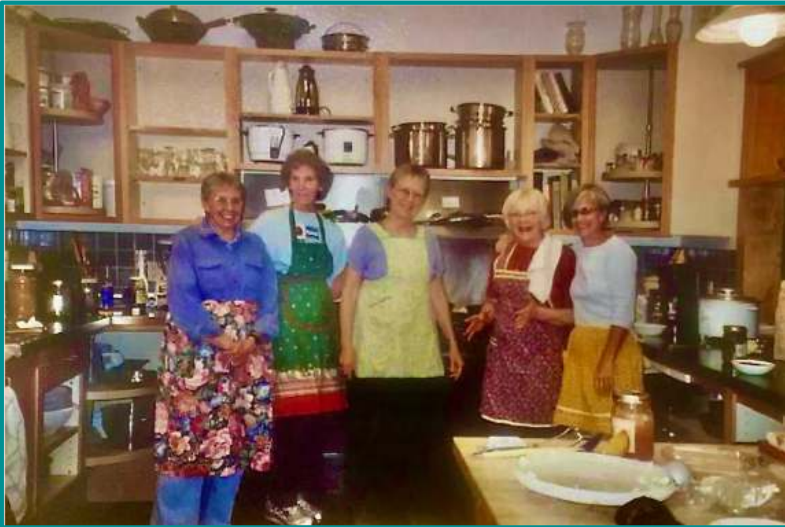
Working in the kitchen