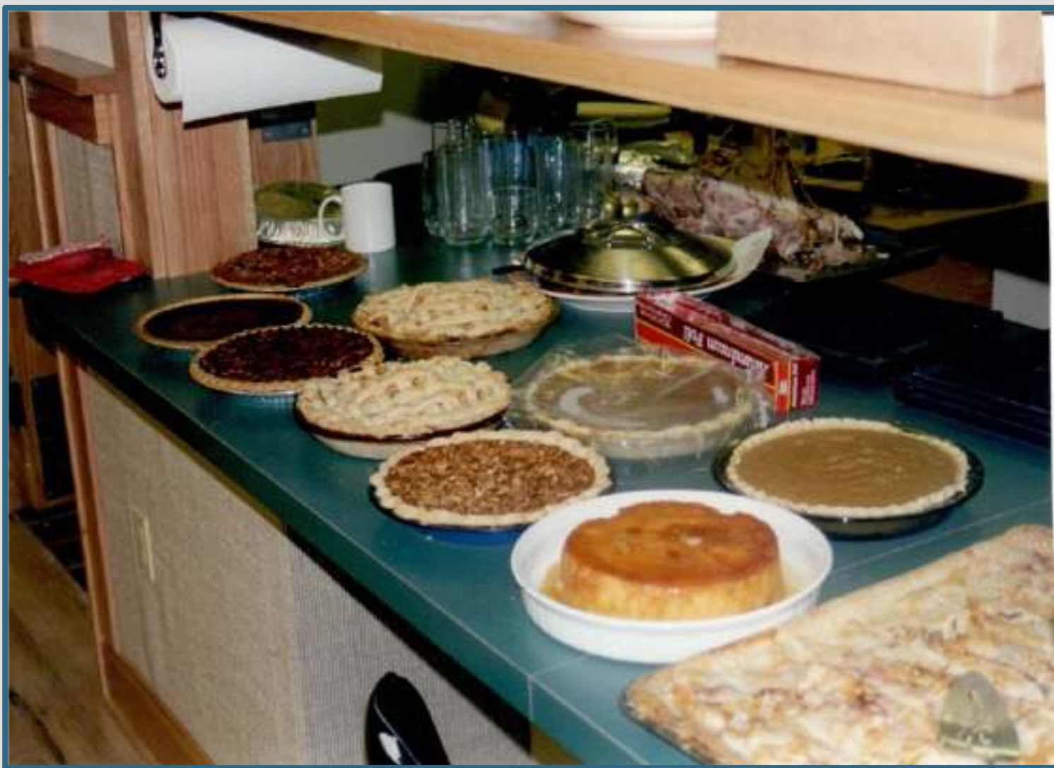
Thanksgiving treats, 1999