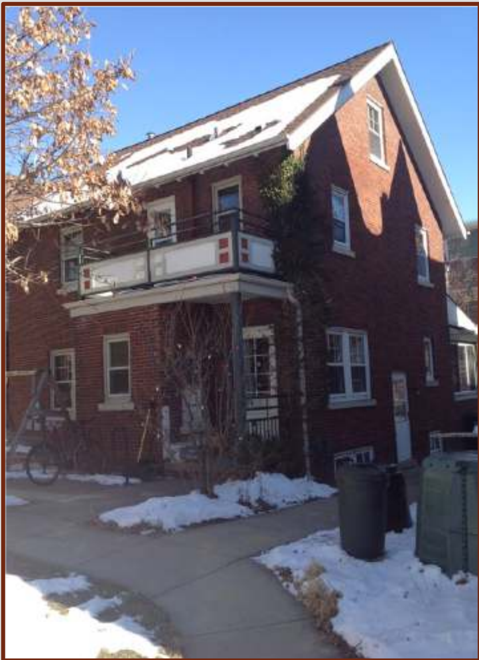
Red Brick House, 1920's