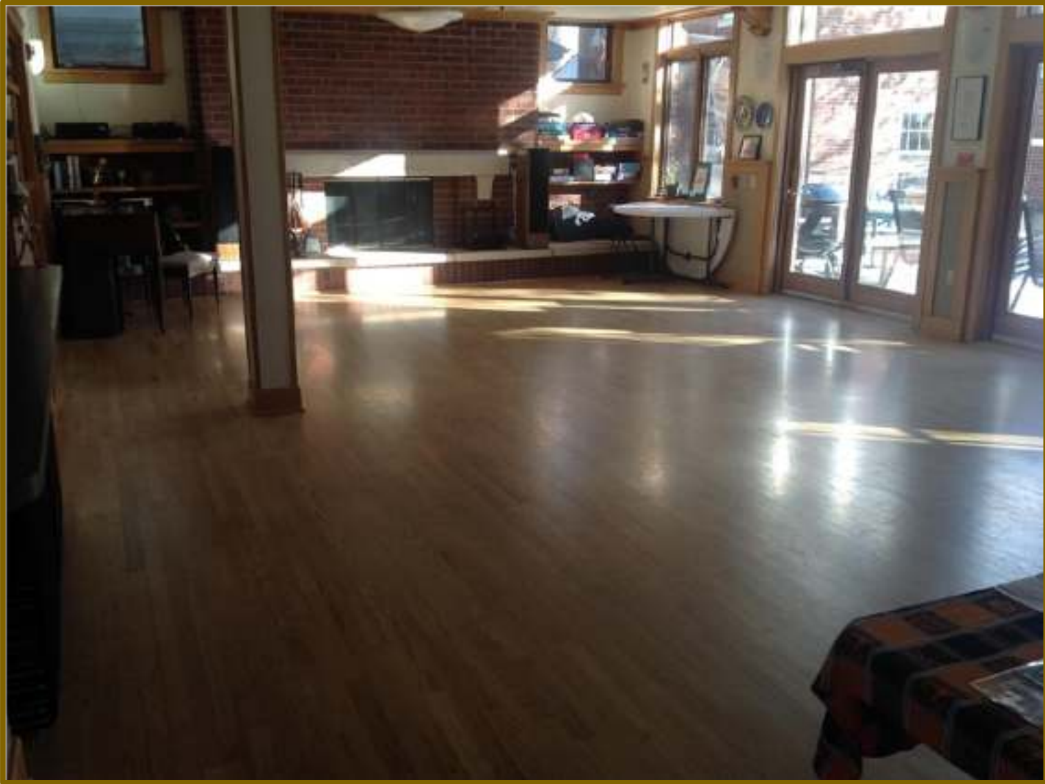
Common dining room - meeting room