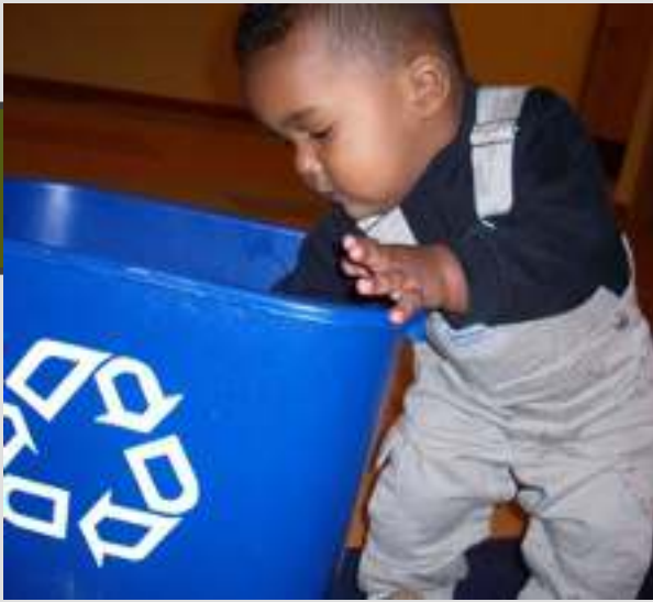
All Ages Take Part