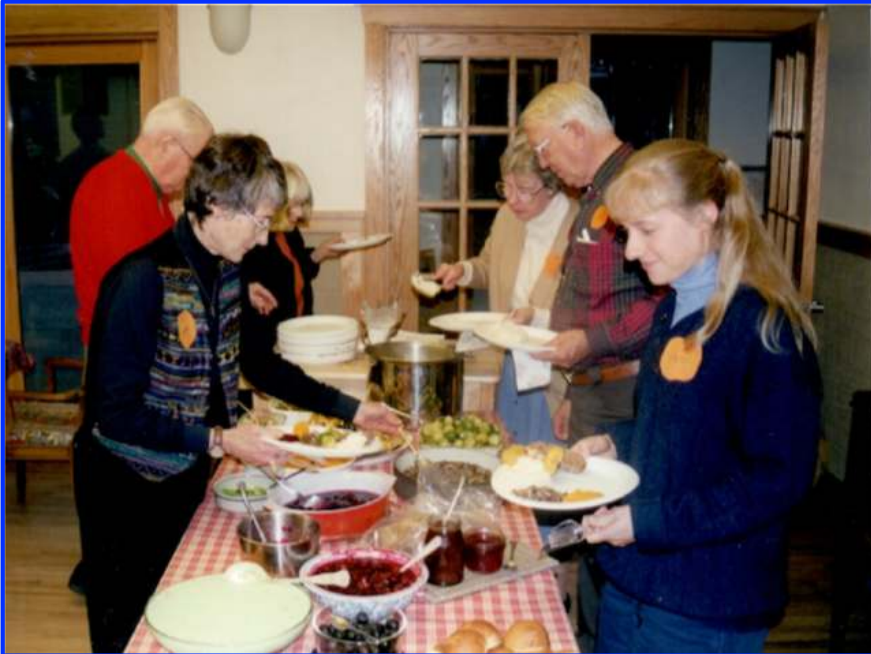
Serving our dinner Thanksgiving, 1999