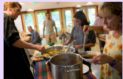
Residents of a "cohousing" community in Sacramento gather for dinner.

...removing some of the barriers to communal living would give America's growing population of single people the opportunity, at least, to decide if living with other people works for them. It might also encourage American in general to think more creatively about our homes, our cities and our social networks.