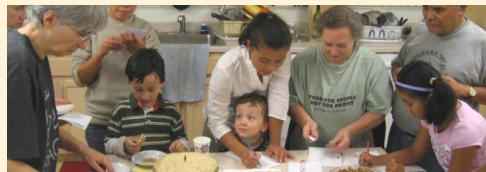
Truly a great kitchen

Many thanks to everyone who hosted me and nurtured me on my travels!