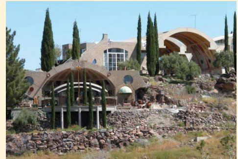
Arcosanti : a laboratory in innovative design, community, and environmental accountability.