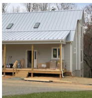
4 Homes available Emerson Commons by Charlottesville, VA