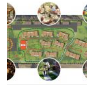
Heartwood Commons Tulsa, OK