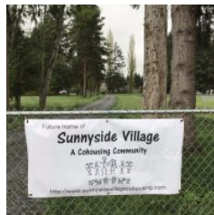
Sunnyside Village Marysville, WA