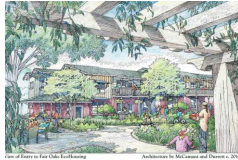
Fair Oaks EcoHousing Fair Oaks, CA