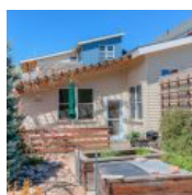
2 master suite condo