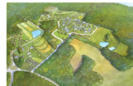
Rocky Corner Cohousing Bethany, CT