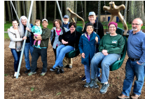
Evans Oaks Cottages Silverton, OR