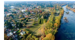
Oakleigh Meadow Cohousing Eugene, OR