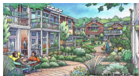
Haystack Heights Spokane, WA