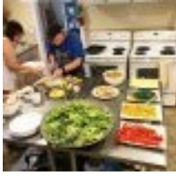
Nubanusit Neighborhood and Farm Peterborough, NH