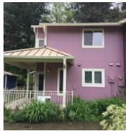
Cascadia Commons Portland, OR