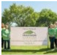
Heartwood Commons Tulsa, OK