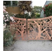
Temescal Creek Cohousing Community Oakland, CA