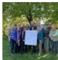
Skagit Cohousing Anacortes, WA