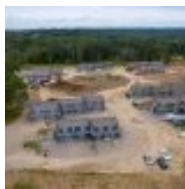
Rocky Corner Cohousing New Haven, CT