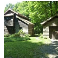
Common Farms Poesten, NY