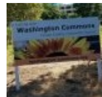
Washington Commons West Sacramento, CA