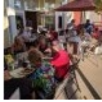
Wolf Creek Lodge Grass Valley, CA