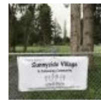
Sunnyside Village Cohousing Marysville, WA