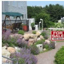
Burlington Cohousing East Village Burlington, VT