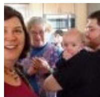
Bay State Commons Malden, MA