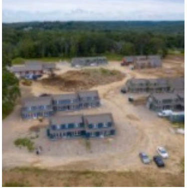
Rocky Corner Cohousing New Haven, CT