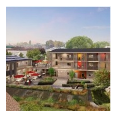
Our Home - Cathedral Park Portland, OR