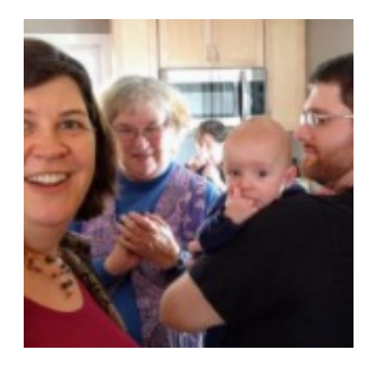
Bay State Commons Malden, MA