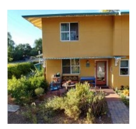
Pleasant Hill Cohousing SF Bay Area, CA