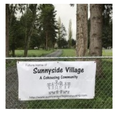
Sunnyside Village Cohousing Marysville, WA