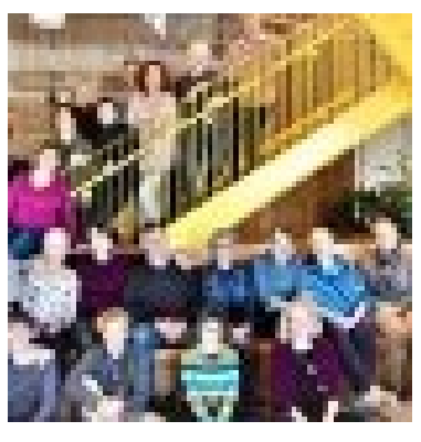
Bull City Commons Cohousing Community Durham, NC