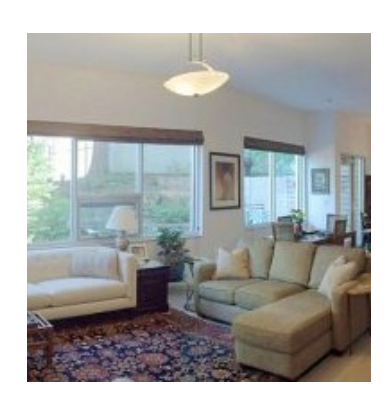
<u>Durham Central Park Cohousing</u> <u>Durham, North Carolina</u>