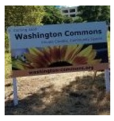
Washington Commons West Sacramento, CA