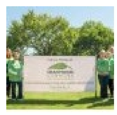
Heartwood Commons Tulsa, OK