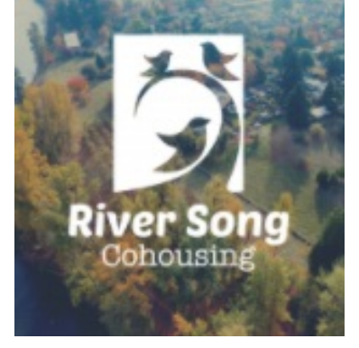
River Song Cohousing Eugene, OR