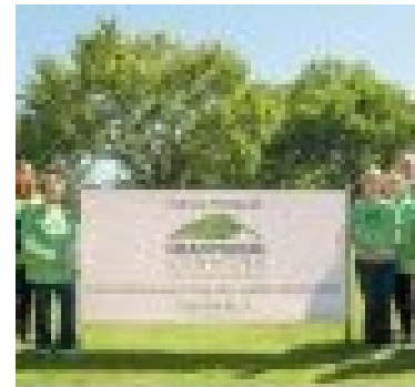
Heartwood Commons Tulsa, OK