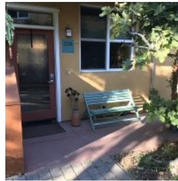
Pleasant Hill Cohousing SF Bay Area, CA