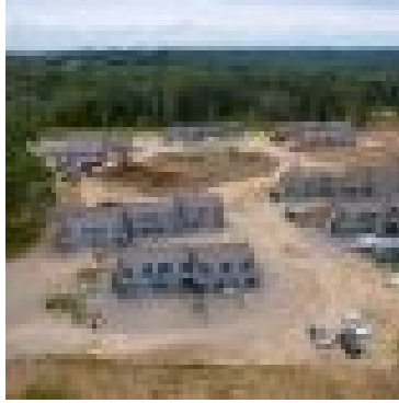
Rocky Corner Cohousing New Haven, CT