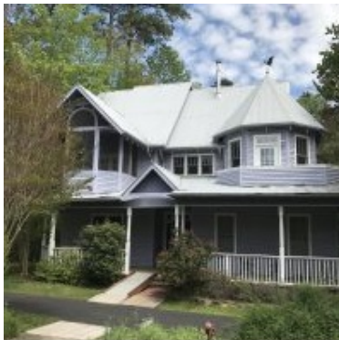
Arcadia Cohousing Chapel Hill, NC