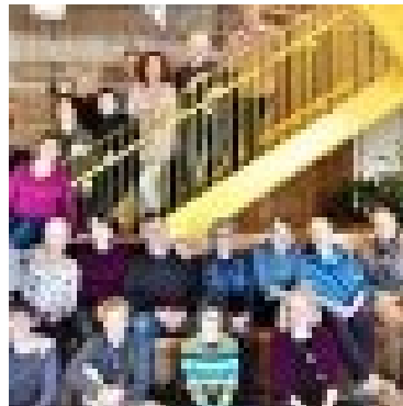
Bull City Commons Cohousing Community Durham, NC