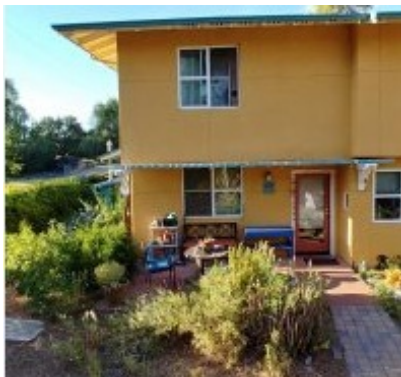
Pleasant Hill Cohousing SF Bay Area, CA