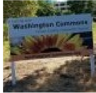
Washington Commons West Sacramento, CA