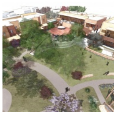
Cohousing ABQ Albuquerque, NM