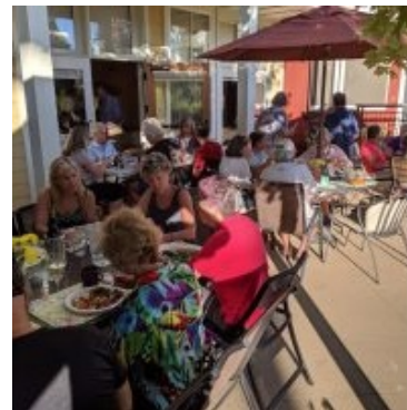
Wolf Creek Lodge Grass Valley, CA