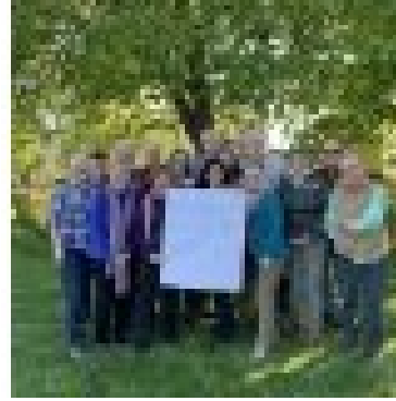
Skagit Cohousing Anacortes, WA