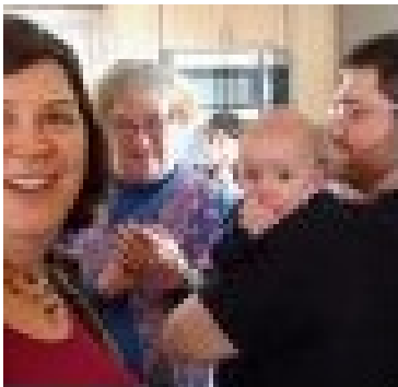
Bay State Commons Malden, MA