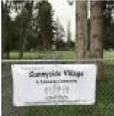
Sunnyside Village Cohousing Marysville, WA