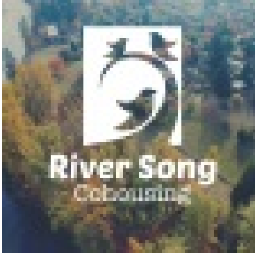
River Song Cohousing Eugene, OR