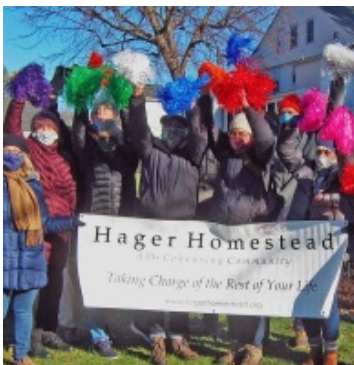
Hager Homestead Littleton, MA