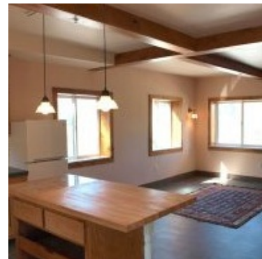
Haystack Heights Cohousing Spokane, WA