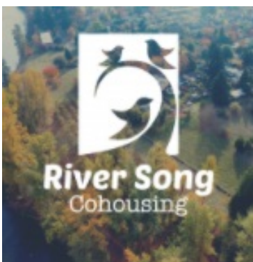
River Song Cohousing