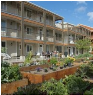
Mountain View CoHousing Community Mountain View, CA