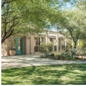
Milagro Cohousing Community Tucson, AZ