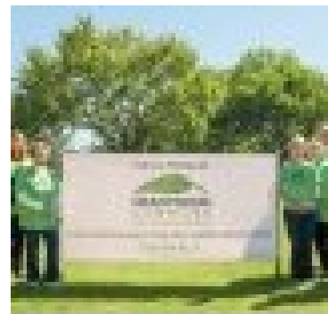
Heartwood Commons Tulsa, OK