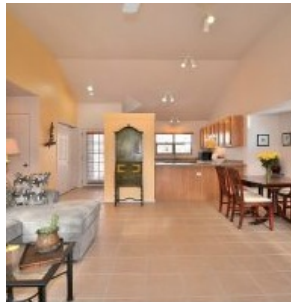
Sand River Cohousing Santa Fe, NM