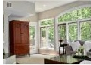
Arcadia Cohousing Chapel Hill, NC