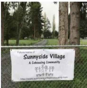
Sunnyside Village Cohousing Marysville, WA