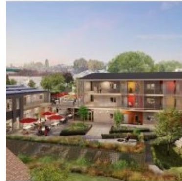
Skagit Cohousing Anacortes, WA