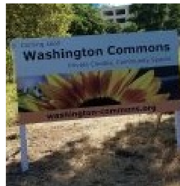
Washington Commons West Sacramento, CA