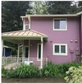
Cascadia Commons Portland, OR