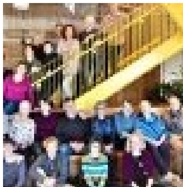
Bull City Commons Cohousing Community Durham, NC