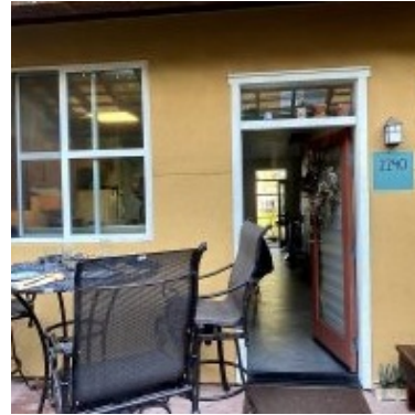
Pleasant Hill Cohousing SF Bay Area, CA