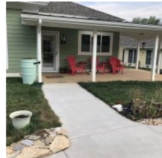
Shepherd Village Shepherdstown, WV