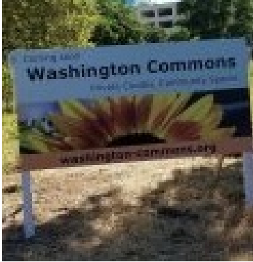
Washington Commons West Sacramento, CA