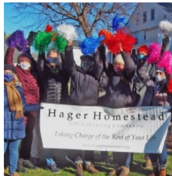
Hager Homestead Littleton, MA