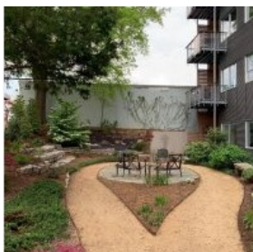
Durham Central Park Co-housing Community Durham, NC