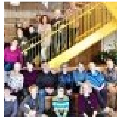
Bull City Commons Cohousing Community Durham, NC