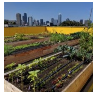
Capital Hill Urban Cohousing Seattle, WA