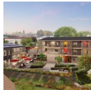
Our Home - Cathedral Park Portland, OR