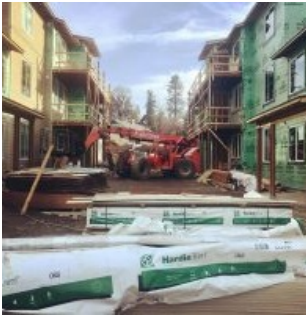
Haystack Heights Cohousing Spokane, WA