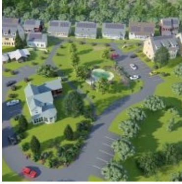
Emerson Commons Crozet, VA