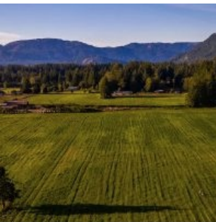
Rooted Northwest Arlington, WA