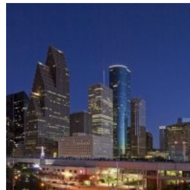
Cohousing Houston Houston, TX