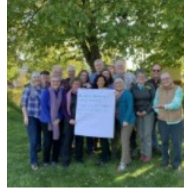
Skagit Cohousing Anacortes, WA