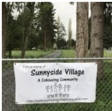
Sunnyside Village Cohousing Marysville, WA