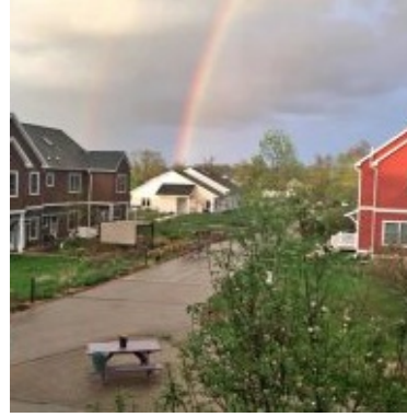
Touchstone Cohousing Ann Arbor, MI