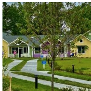
Village Hearth Durham, NC