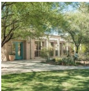
Milagro Cohousing Community Tucson, AZ