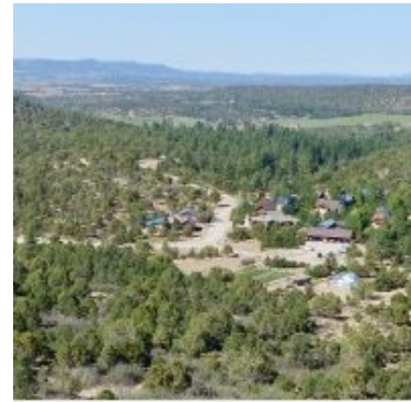
Heartwood Cohousing Bayfield, CO