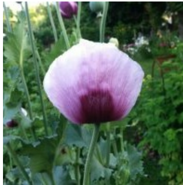
Neurodiverse Village Retreat a sunny location in OR