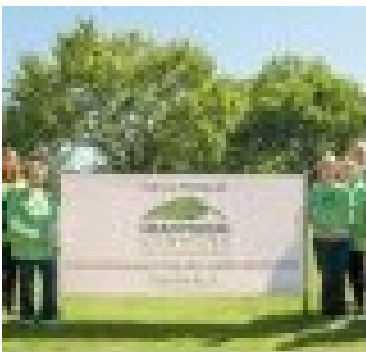
Heartwood Commons Tulsa, OK