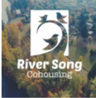
River Song Cohousing Eugene, OR