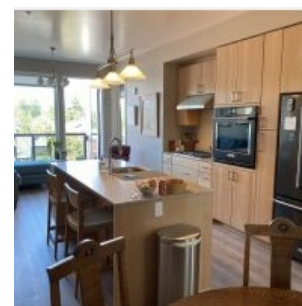
PDX Commons Portland, OR