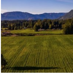
Rooted Northwest Arlington, WA