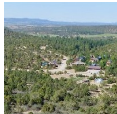
Heartwood Cohousing Bayfield, CO