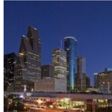
Cohousing Houston Houston, TX