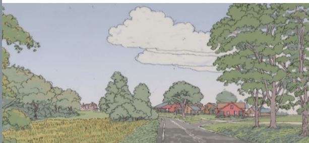
Rachel Carson Ecovillage Gibsonia, PA