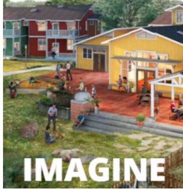
River Song Cohousing Eugene, OR