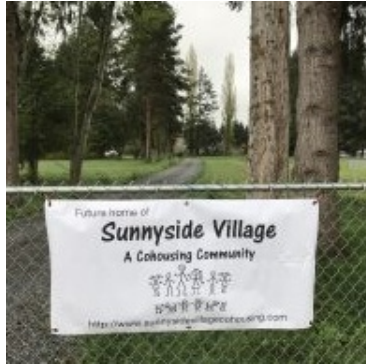
Sunnyside Village Cohousing Marysville, WA