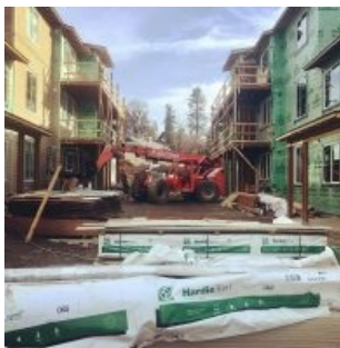
Haystack Heights Cohousing Spokane, WA