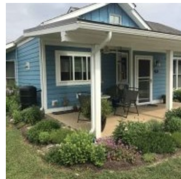
Shepherd Village Shepherdstown, WV