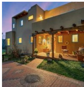
Harmony Village Golden, CO