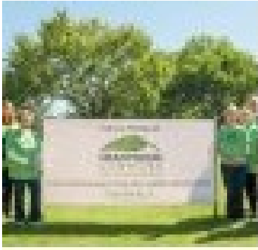
Heartwood Commons Tulsa, OK