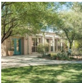
Milagro Cohousing Community Tucson, AZ