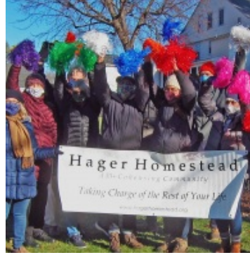
Hager Homestead Littleton, MA