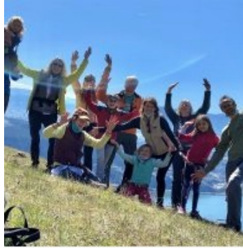
Adams Creek Cohousing Hood River, OR