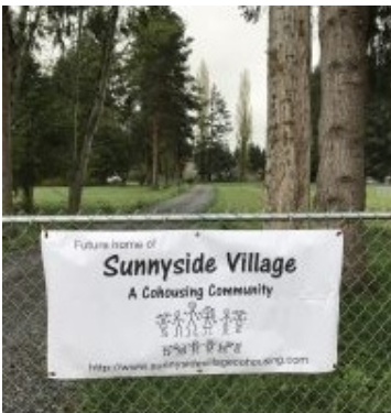
Sunnyside Village Marysville, WA