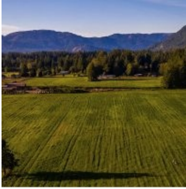
Rooted Northwest Arlington, WA