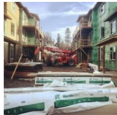
Haystack Heights Cohousing