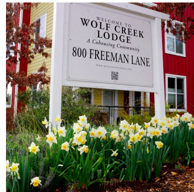
Wolf Creek Lodge Grass Valley, CA