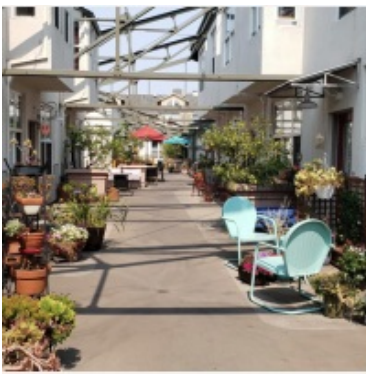
Swan's Market Cohousing Oakland, CA