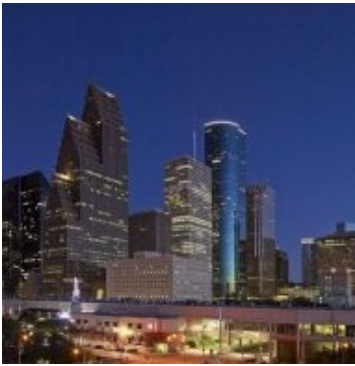
CoHousing Houston Houston, TX