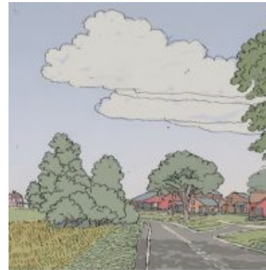
Rachel Carson EcoVillage Gibsonia, PA