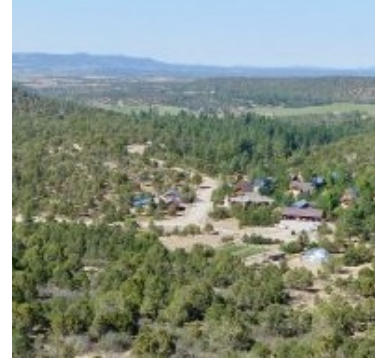
Heartwood Cohousing Bayfield, CO