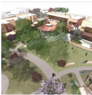
Cohousing ABQ Albuquerque, NM