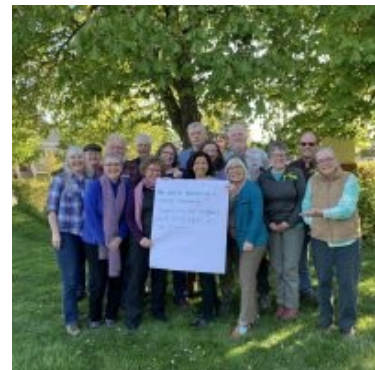
Skagit Cohousing Anacortes, WA