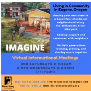
River Song Cohousing Eugene, OR