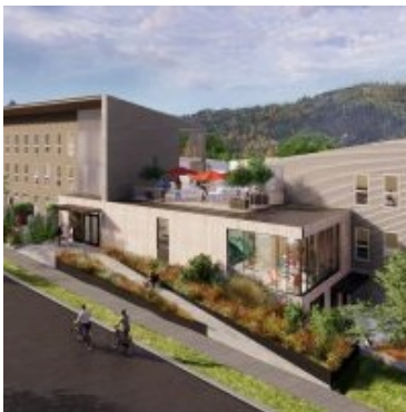
Our Home - Cathedral Park Portland, OR