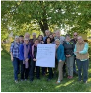
Skagit Cohousing Anacortes, WA