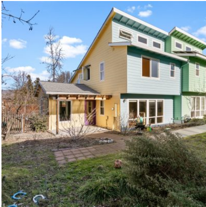
Beautiful Townhouse for Sale in Amazing Ashland Cohousing