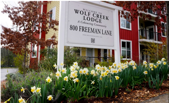
Wolf Creek Lodge, Grass Valley, CA