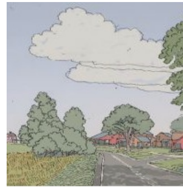
Rachel Carson EcoVillage Gibsonia, PA