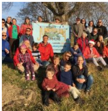
Juniper Hill Commons Harrisburg, VA