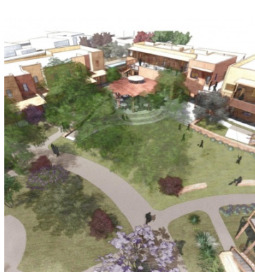
Cohousing ABQ Albuquerque, NM