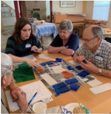
Washington Commons West Sacramento, CA