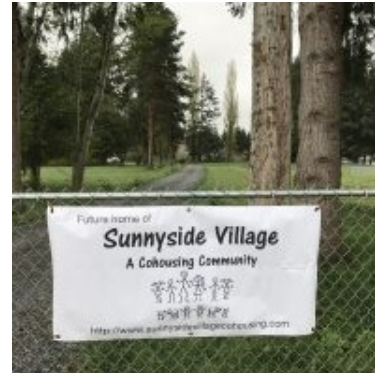
Sunnyside Village Marysville, WA