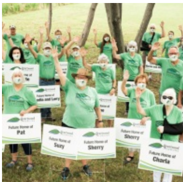
Heartwood Commons Tulsa, OK