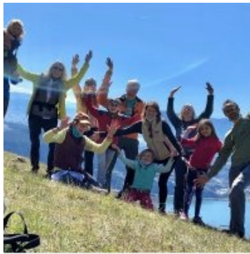
Adams Creek Cohousing Hood River, OR