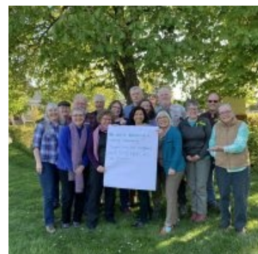
Skagit Cohousing Anacortes, WA