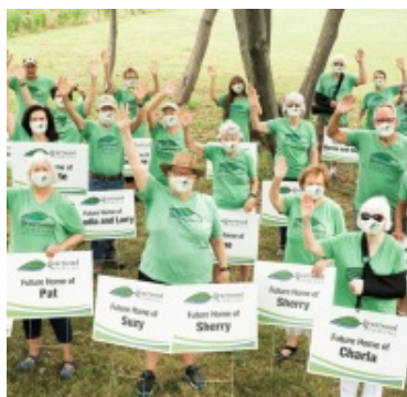
Heartwood Commons Tulsa, OK