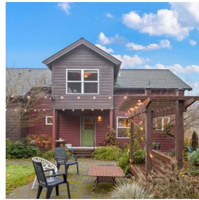
Amazing Opportunity in West Seattle Washington