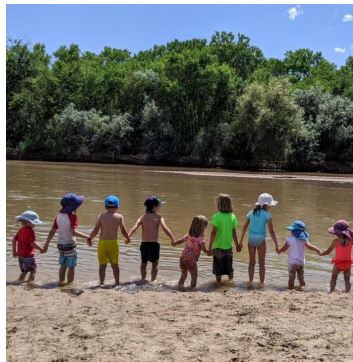
Cohousing ABQ Albuquerque, NM