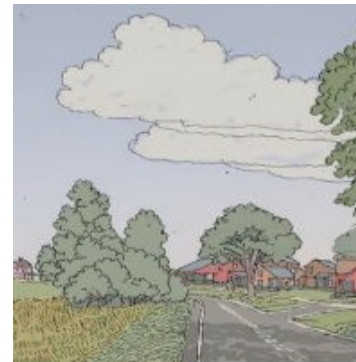
Rachel Carson EcoVillage Gibsonia, PA