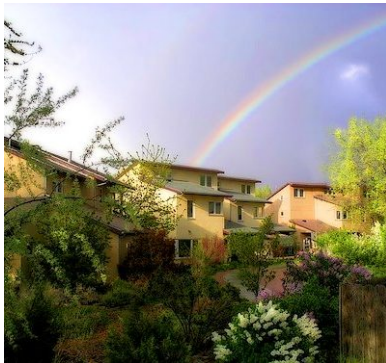
Homes Available in Established, Close- Knit, Urban Community in Salt Lake City Wasatch Commons, UT