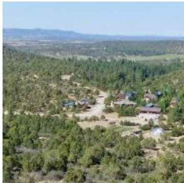
Heartwood Cohousing Bayfield, CO