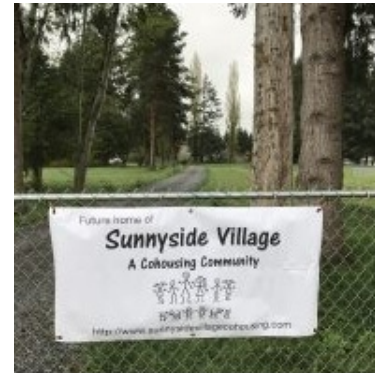
Sunnyside Village Marysville, WA