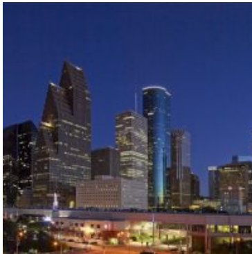
Cohousing Houston Houston, TX