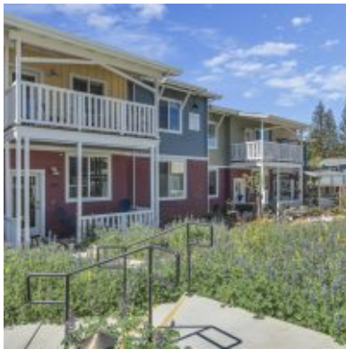
Charming, Light-Filled, 2-Bedroom Flat Fair Oaks EcoHousing, CA