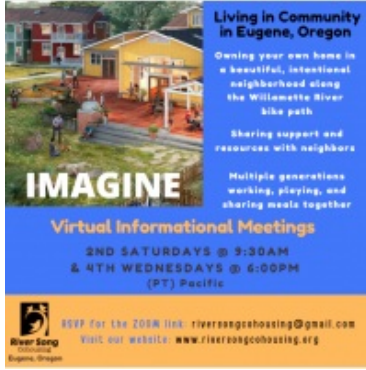
River Song Cohousing Eugene, OR