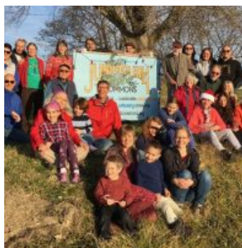
Juniper Hill Commons Harrisburg, VA