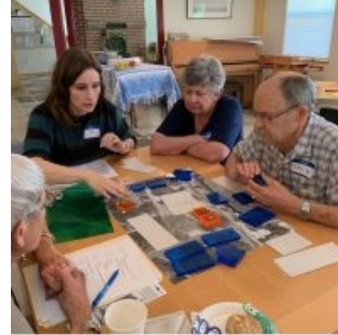
Washington Commons West Sacramento, CA