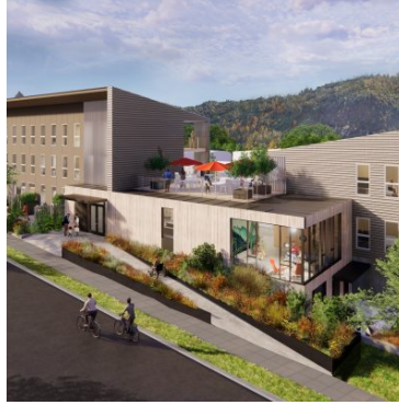
Our Home - Cathedral Park Portland, OR