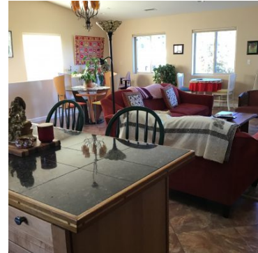
Short Term rental in Prescott AZ Manzanita Village Cohousing Prescott, AZ