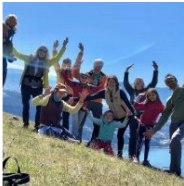
Adams Creek Cohousing Hood River, OR