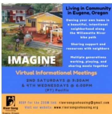
River Song Cohousing Eugene, OR