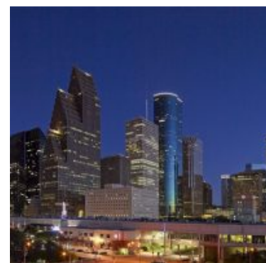
Cohousing Houston Houston, TX