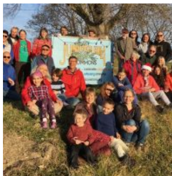
Juniper Hill Commons Harrisburg, VA