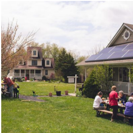
Liberty Village Union Bridge, MD