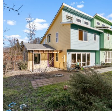
Beautiful Townhouse for Sale in Amazing Ashland Cohousing Ashland, OR