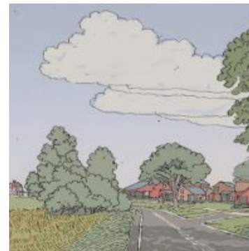
Rachel Carson EcoVillage Gibsonia, PA