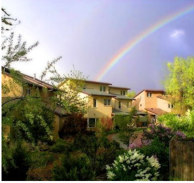
Homes Available in Established, Close-Knit, Urban Community in Salt Lake City Wasatch Commons, UT