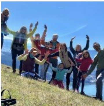
Adams Creek Cohousing Hood River, OR