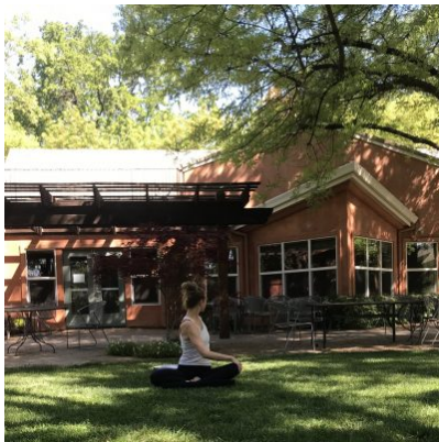
Beautiful 4 bed and 2-1/2 bath 1650 sf custom home in well established multi-generational cohousing community next to Bidwell Park in Chico CA