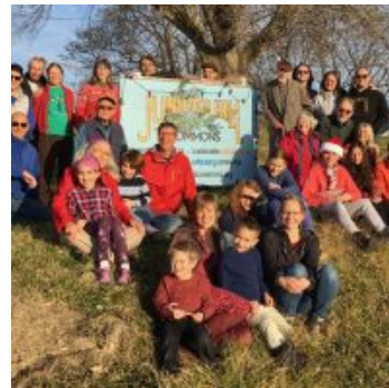
Juniper Hill Commons Harrisburg, VA