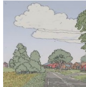
Rachel Carson EcoVillage Gibsonia, PA