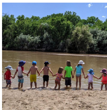
Cohousing ABQ Albuquerque, NM