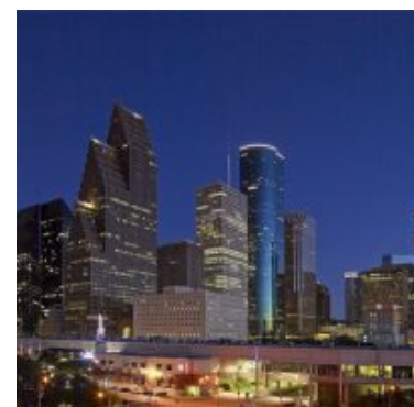
Cohousing Houston Houston, TX