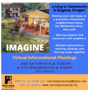
River Song Cohousing Eugene, OR