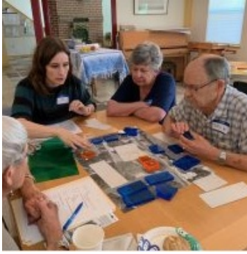
Washington Commons West Sacramento, CA