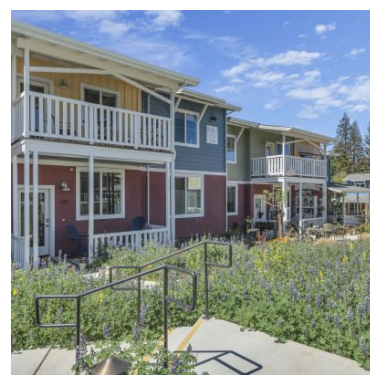
Light-Filled, 2-Bedroom Downstairs Flat in Multi-Generational, Pet-Friendly Community—Fair Oaks EcoHousing, CA