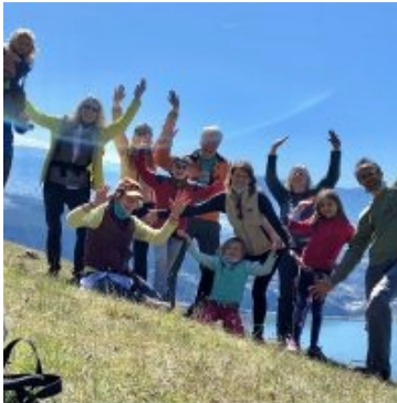
Adams Creek Cohousing Hood River, OR