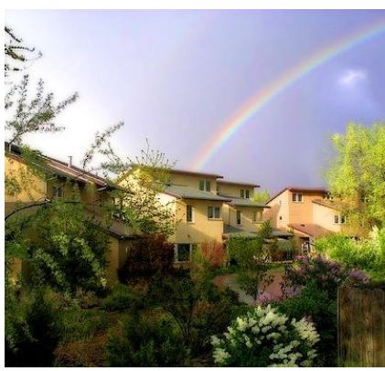
Homes Available in Established, Close-Knit, Urban Community in Salt Lake City Wasatch Commons, UT