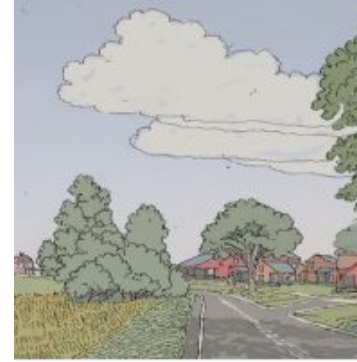
Rachel Carson EcoVillage Gibsonia, PA