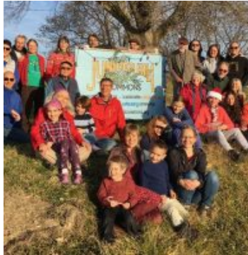
Juniper Hill Commons Harrisburg, VA