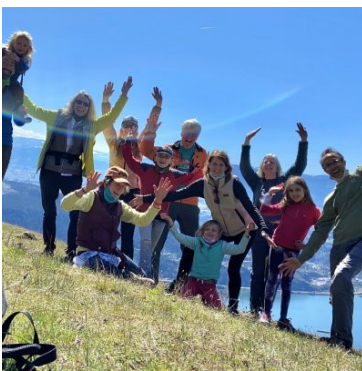
Adams Creek Cohousing Hood River, OR

Forming Communities and Communities Seeking Members