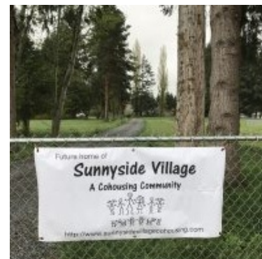
Sunnyside Village Marysville, WA