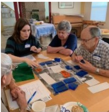
Washington Commons West Sacramento, CA