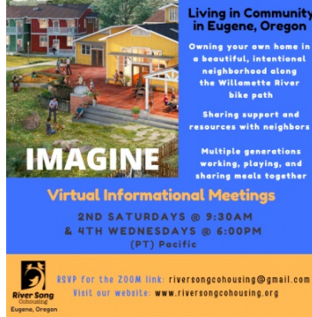
River Song Cohousing Eugene, OR