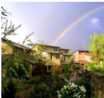
Salt Lake City, UT Homes Available in Established, Close-