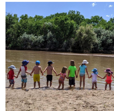
Cohousing ABQ Houston, TX