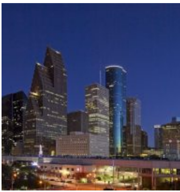
Cohousing Houston Houston, TX