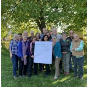
Skagit Cohousing Anacortes, WA