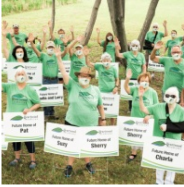
Heartwood Commons-Tulsa Tulsa, OK