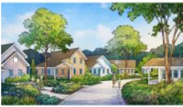
Carter Farm - View from the Woonerf (Living Street)