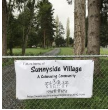
Sunnyside Village Cohousing Marysville, WA