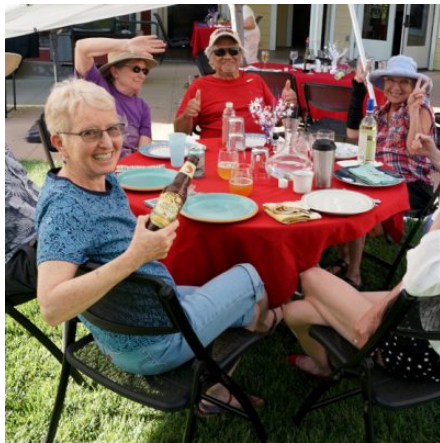
Grass Valley, CA

For Sale: One bedroom, one bath house available in Wolf Creek Lodge Adult Cohousing.