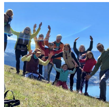
Adams Creek Cohousing Hood River, OR