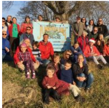
Juniper Hill Commons Harrisonburg, VA