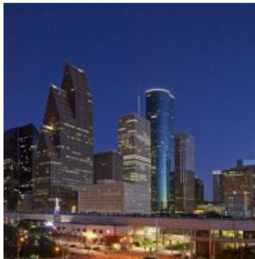
Cohousing Houston Houston, TX