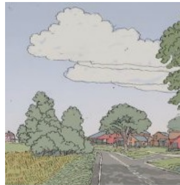
Rachel Carson EcoVillage Gibsonia, PA