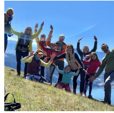
Adams Creek Cohousing Hood River, OR