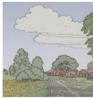
Rachel Carson EcoVillage Gibsonia, PA