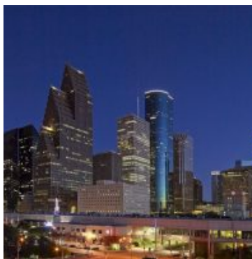
Cohousing Houston Houston, TX