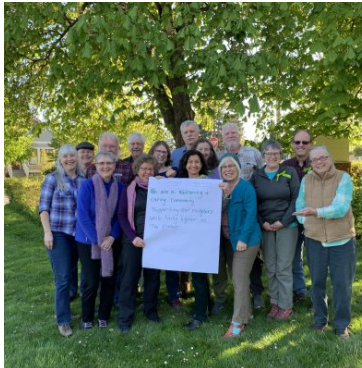
Skagit Commons Anacortes, WA