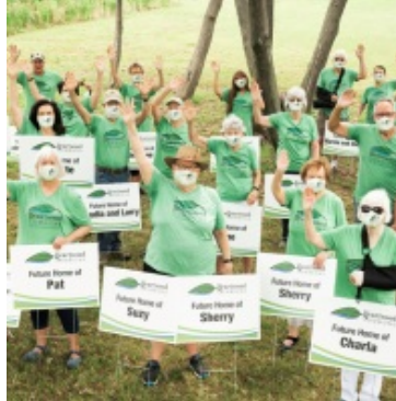
Juniper Hill Commons Harrisonburg, VA