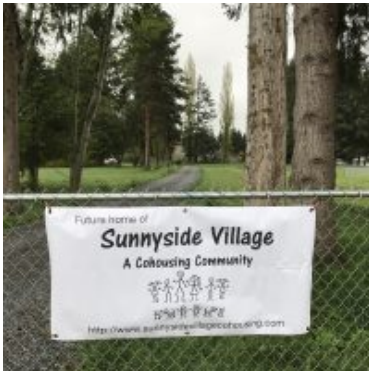
Sunnyside Village Cohousing Seattle, WA

Forming Communities and Communities Seeking Members