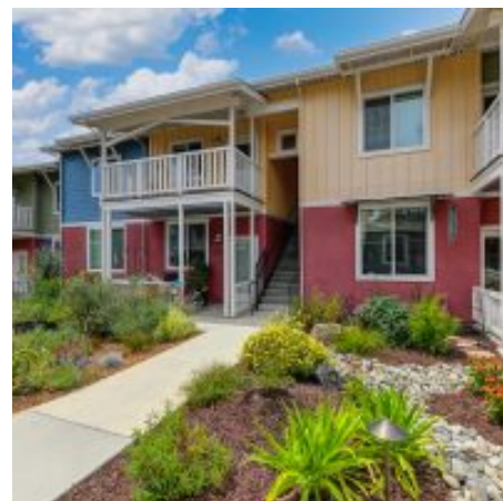
Fair Oaks, CA

For Sale: 2 bedroom, 1 bath, architecturally designed, first floor home available at Prairie Hill Cohousing.