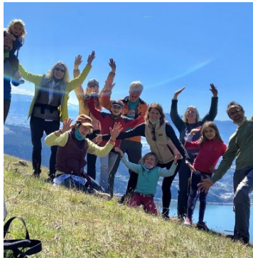
Adams Creek Cohousing Hood River, OR