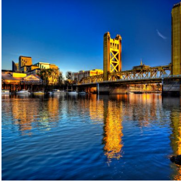
Washington Commons West Sacramento, CA