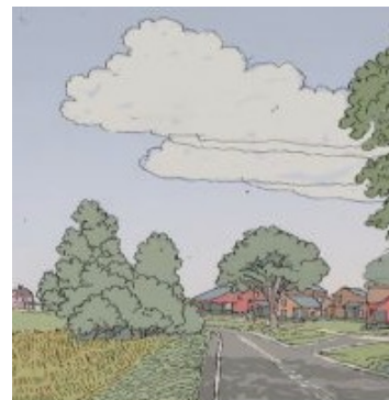
Rachel Carson EcoVillage Gibsonia, PA