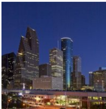
Cohousing Houston Houston, TX