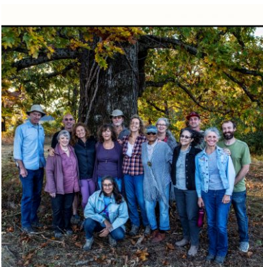
Burns Village & Farm Cohousing and Agrihood Community Burns, TN