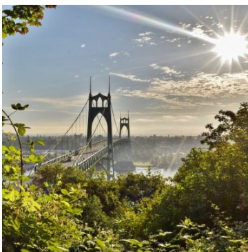
Cathedral Park Cohousing Portland, OR