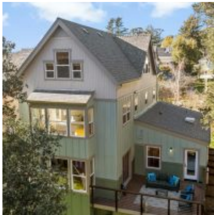
Santa Cruz, CA

For Sale: 5 bedroom light-filled beauty at Coyote Crossing