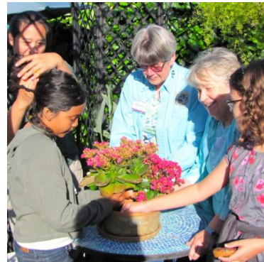
Mission Peak Village Fremont, CA