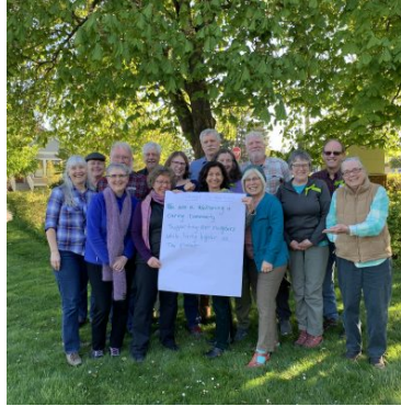
Skagit Commons Anacortes, WA