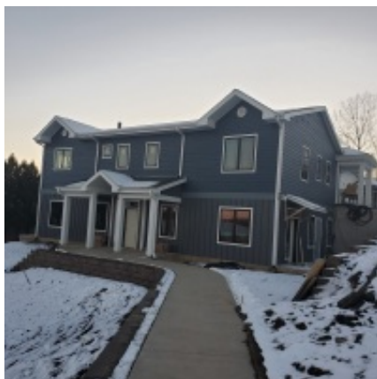
Iowa City, Iowa

For Sale: *price reduced* LBGT-focused 55+ community - 2 bedroom, 2 bath home available in Village Hearth Cohousing