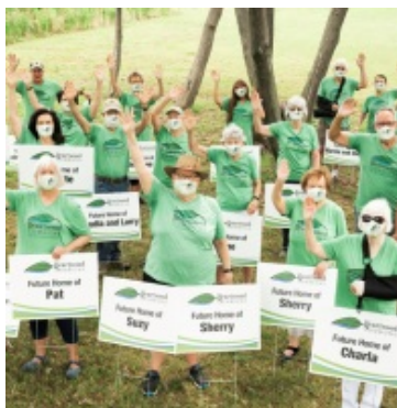
Heartwood Commons Tulsa, OK