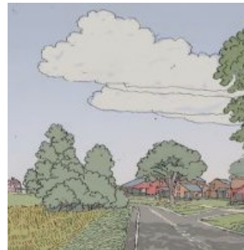
Rachel Carson EcoVillage Gibsonia, PA