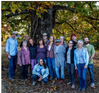
Burns Village & Farm Cohousing and Agrihood Community Burns, TN