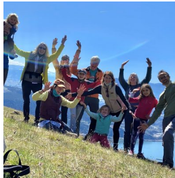
Adams Creek Cohousing Hood River, OR