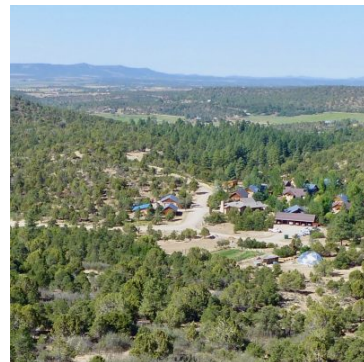
Heartwood Cohousing Bayfield, CO