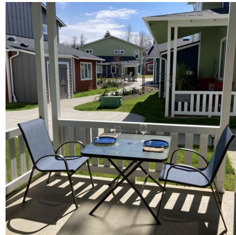
Eugene, OR For Sale: Community by the river, 4bed/3bath, brand new community