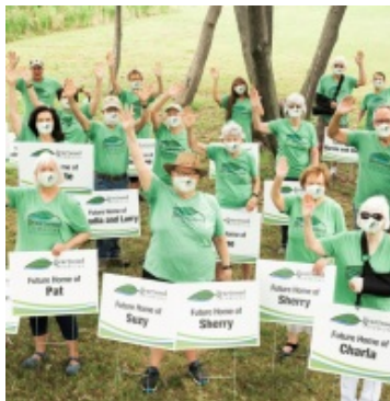
Heartwood Commons Tulsa, OK