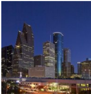
Cohousing Houston Houston, TX