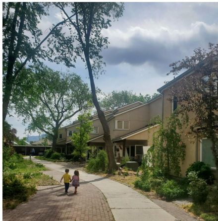
Salt Lake City, UT For Sale: 3-Bedroom for sale at Wasatch Commons