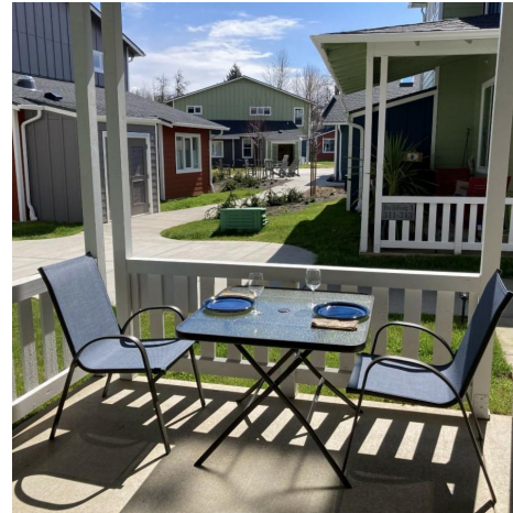
Eugene, OR For Sale: Community by the river, 4bed/3bath, brand new community