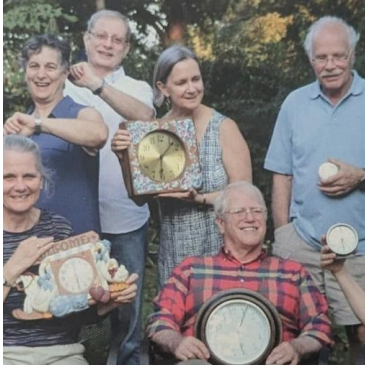
Cohousing of Greater Baltimore Catonsville, MD