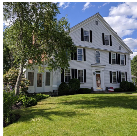
Littleton, MA For Sale: One Home Left in New England's First Over-55 Cohousing Community: 1 br # Den