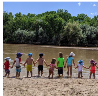
Cohousing ABQ Albuquerque, NM