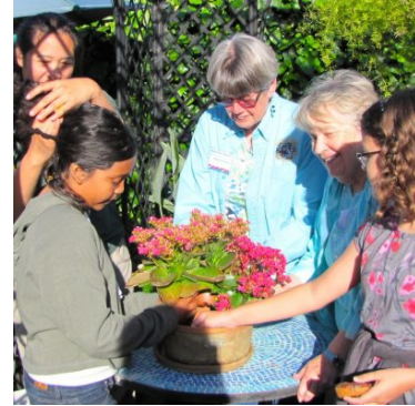
Mission Peak Village Fremont, CA