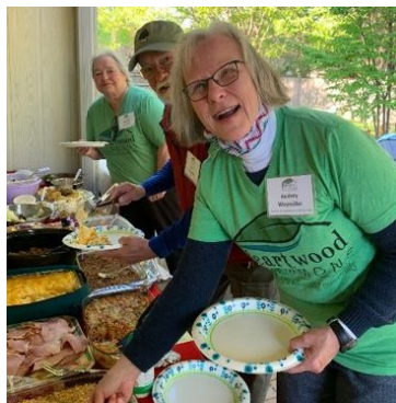
Heartwood Commons Tulsa, OK