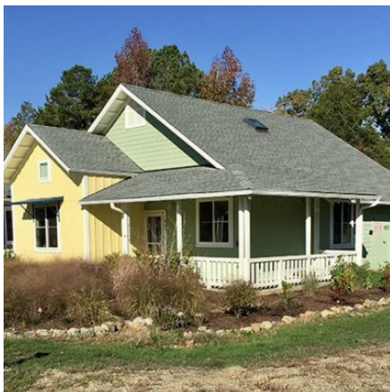
Durham, NC For Sale: *price reduced* LGBT-focused 55+ community - 2 bedroom, 2 bath home available in Village Hearth Cohousing