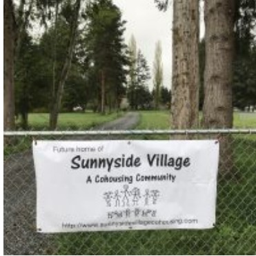
Sunnyside Village Cohousing Seattle, WA