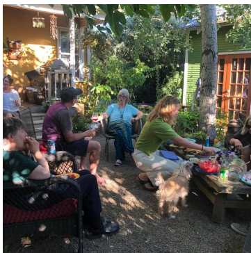
Cathedral Park Cohousing Portland, OR