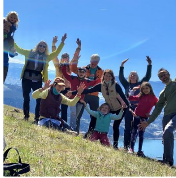
Adams Creek Cohousing Hood River, OR