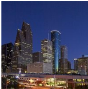
Cohousing Houston Houston, TX