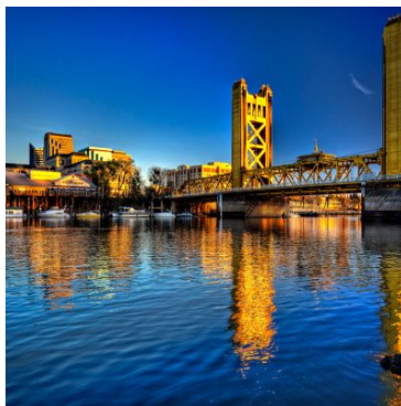
Washington Commons West Sacramento, CA