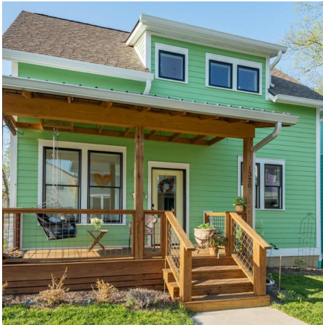
Bloomington, IN For Sale: Growing Cohousing Community! 3 bd/2ba, 1,233 sq ft, and built in 2021