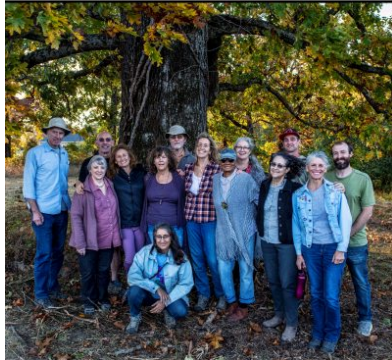
Burns Village & Farm Cohousing and Agrihood Community Burns, TN