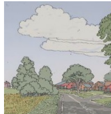
Rachel Carson EcoVillage Gibsonia, PA