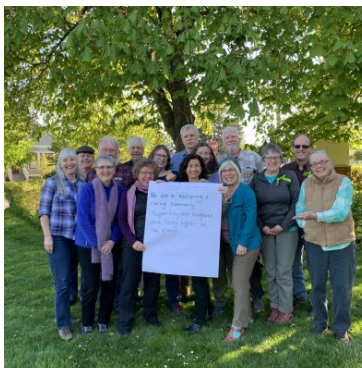
Skagit Commons Anacortes, WA