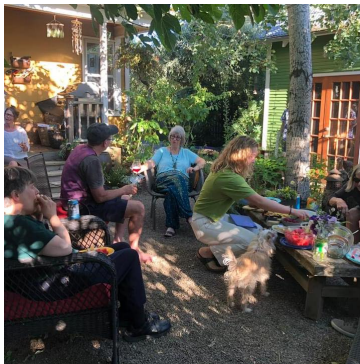
Cathedral Park Cohousing Portland, OR