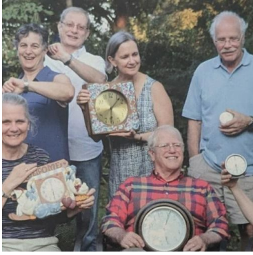
Cohousing of Greater Baltimore Catonsville, MD