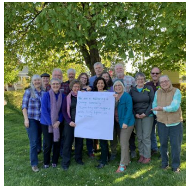
Skagit Commons Anacortes, WA