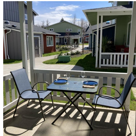
Eugene, OR For Sale: Community by the river, 4bed/3bath, brand new community