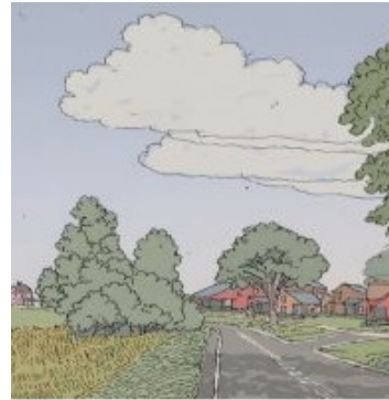
Rachel Carson EcoVillage Gibsonia, PA