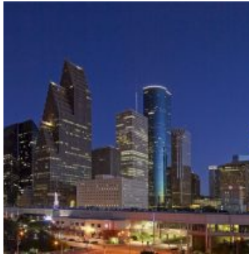
Cohousing Houston Houston, TX