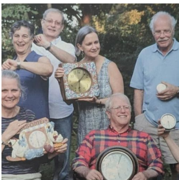
Cohousing of Greater Baltimore Catonsville, MD