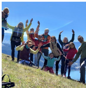
Adams Creek Cohousing Hood River, OR