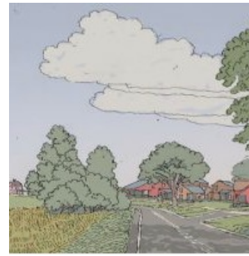
Rachel Carson EcoVillage Gibsonia, PA