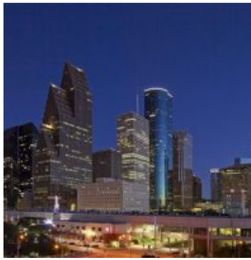
Cohousing Houston Houston, TX