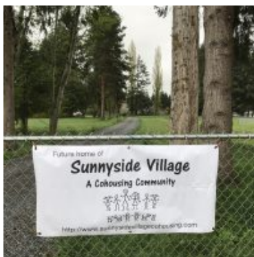
Sunnyside Village Cohousing Seattle, WA

Forming Communities and Communities Seeking Members