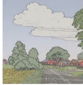
Rachel Carson EcoVillage Gibsonia, PA