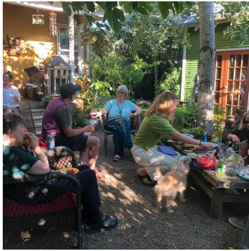
Cathedral Park Cohousing Portland, OR