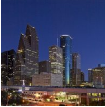
Cohousing Houston Houston, TX