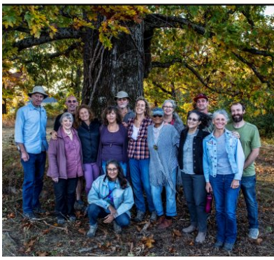
Burns Village & Farm Cohousing and Agrihood Community Burns, TN