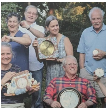
Cohousing of Greater Baltimore Catonsville, MD