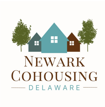
Newark Cohousing Newark, DE