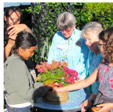
Mission Peak Village Fremont, CA