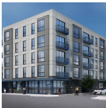
Oak Park Commons Oak Park, IL