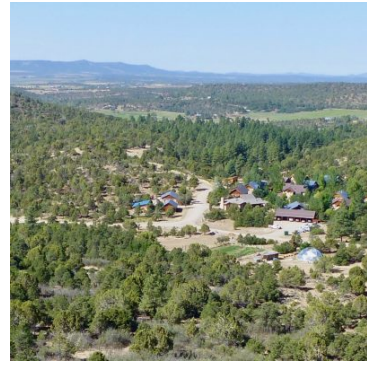
Heartwood Cohousing Bayfield, CO