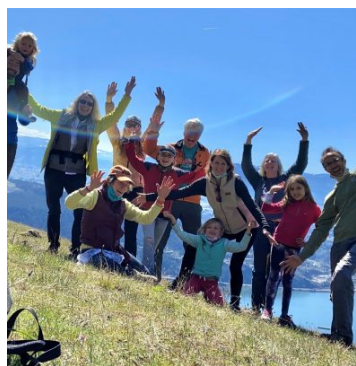
Adams Creek Cohousing Hood River, OR