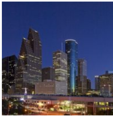
Cohousing Houston Houston, TX