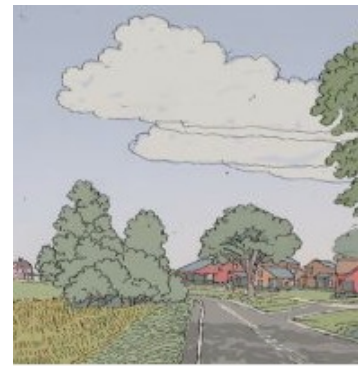
Rachel Carson EcoVillage Gibsonia, PA