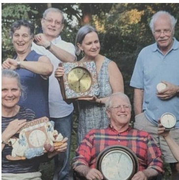
Cohousing of Greater Baltimore Catonsville, MD