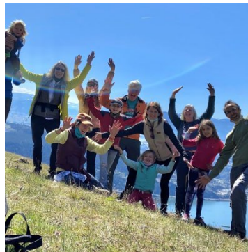
Adams Creek Cohousing Hood River, OR