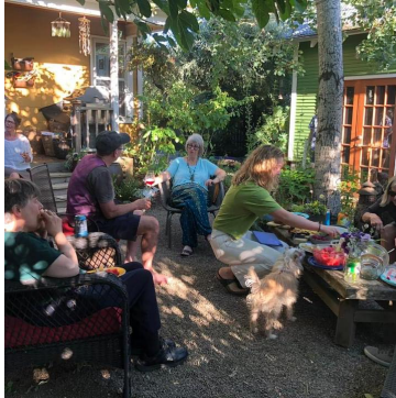
Cathedral Park Cohousing Portland, OR