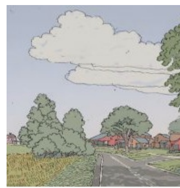
Rachel Carson EcoVillage Gibsonia, PA