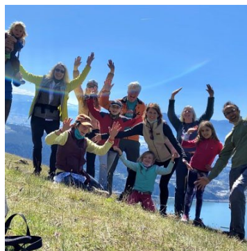
Adams Creek Cohousing Hood River, OR