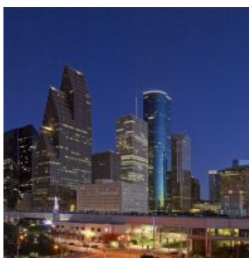
Cohousing Houston Houston, TX