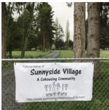
Sunnyside Village Cohousing Seattle, WA

Forming Communities and Communities Seeking Members