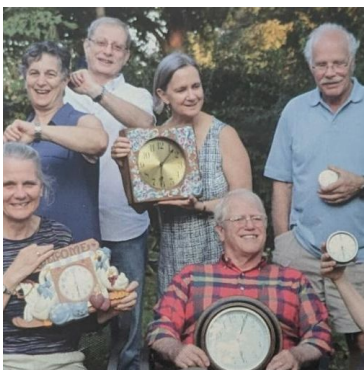
Cohousing of Greater Baltimore Catonsville, MD