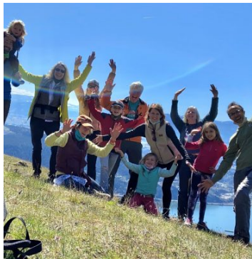
Adams Creek Cohousing Hood River, OR