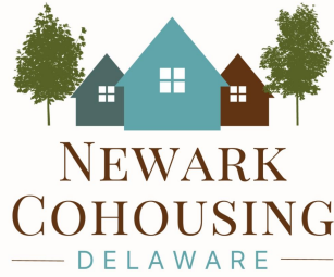
Newark Cohousing Newark, DE