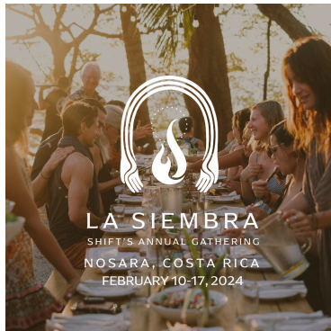
Shift Esperanza Eco-Village Nosara, Costa Rica