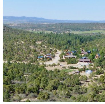
Heartwood Cohousing Bayfield, CO