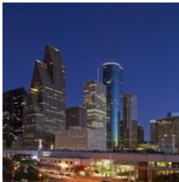
Cohousing Houston Houston, TX