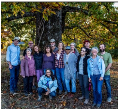
Burns Village & Farm Cohousing and Agrihood Community Burns, TN