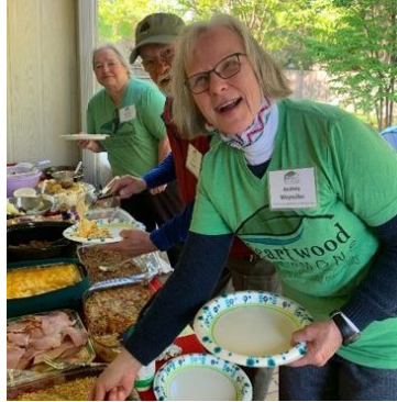
Heartwood Commons Tulsa, OK