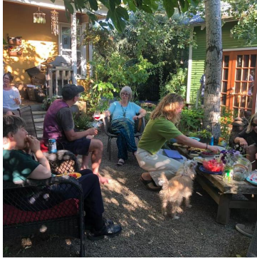
Cathedral Park Cohousing Portland, OR