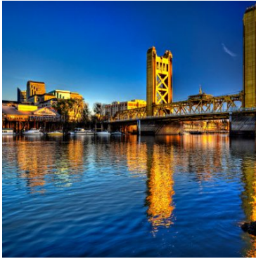
Washington Commons West Sacramento, CA