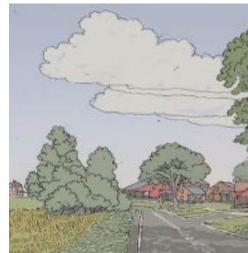
Rachel Carson EcoVillage Gibsonia, PA